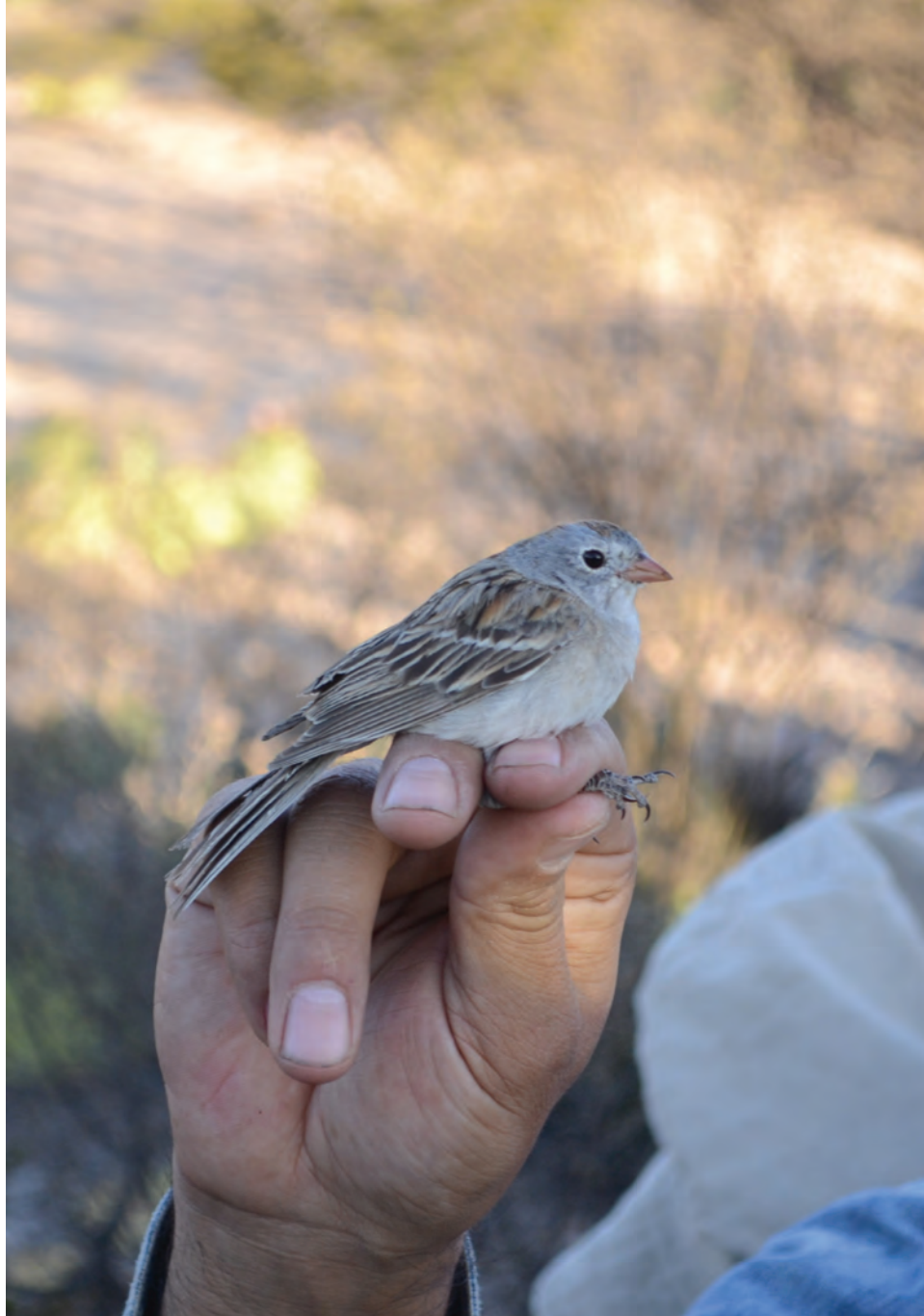
Figure 2. Individual Worthen's sparrow captured on May 10, 2013.

last reports did not provide details about sexes or reproductive activity. Valdés, reported sightings of the species from January 2010 to February 2011 near Santo Domingo, a small town located approximately 75 km northwest of Charcas, San Luis Potosí, and on February 2013 Ruiz Heredia recorded 45 Worthen's sparrows at the southern portion of the latter locality. These reports did not specify vegetation characteristics of the sites accompanying these records, and there are no details on the number of