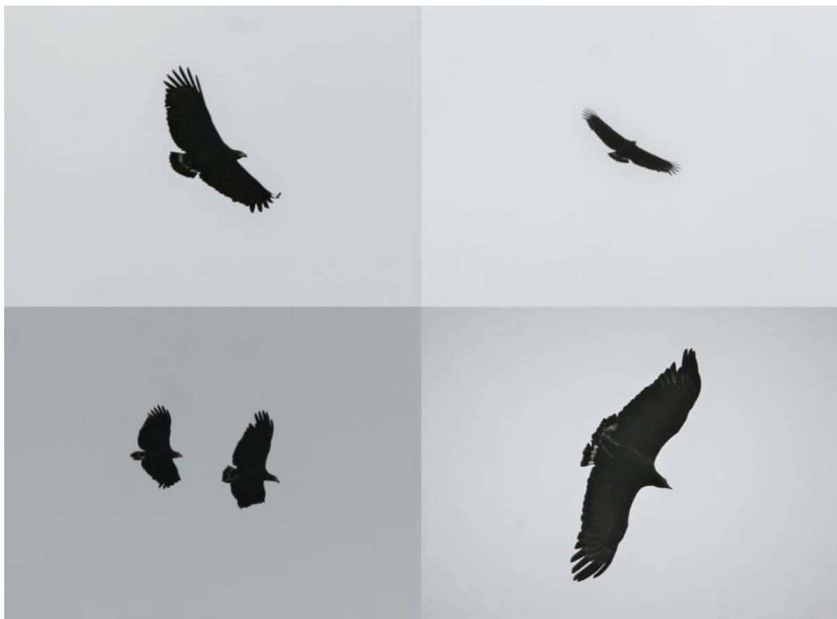
Figure 3. Solitary Eagle in flight photographs for comparison to similar angles of the Great Black Hawk in García-Grajales et al. (2018). Photos taken in Belize by Ryan A. Phillips.

Great Black Hawks and Common Black Hawks are regularly misidentified as Solitary Eagles. Therefore, caution should be taken when identifying Solitary Eagles, especially when documented outside of its known range. It is now possible to correctly identify Solitary Eagles in the field using the newly published characteristics (Clark et al. , 2006; Clark & Schmidt, 2017). It is important to have correct identification of the species involved for records like this.