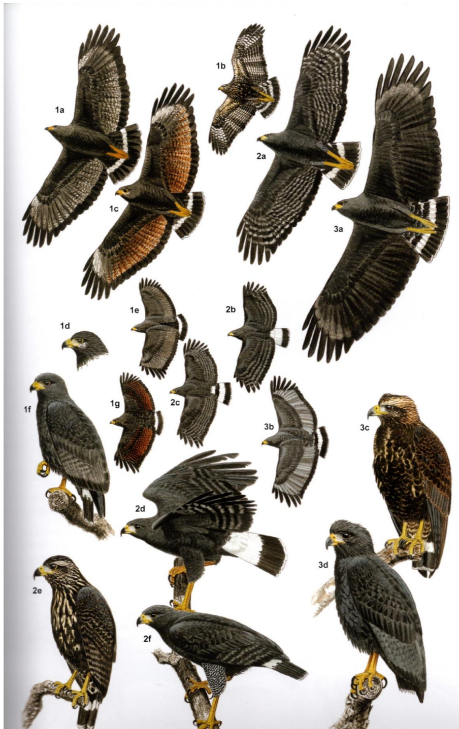
Figure 2b. Buteogallus adults. Plate 15. Reproduced here with editor's permission from Clark and Schmitt 2017. Illustration by John Schmitt.

We compared the photos in García-Grajales et al. (2018) to the illustrations in Howell and Webb (1995) and van Perlo (2006) and, if these guides were used, understand why the adult in the photos were misidentified. The eagle illustrations in those guides are more similar to Great Black Hawk than to Solitary Eagle; one can see this by comparing these illustrations with those showing correct wing shapes in Clark et al. (2006) and illustrations and photographs in Clark and Schmitt (2017).